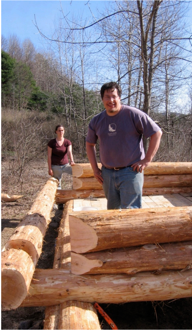
Left: Assembling the Camp Lean To, from cut northern white cedar logs. Below: Large sheets of elm bark goes on the Wickiup.