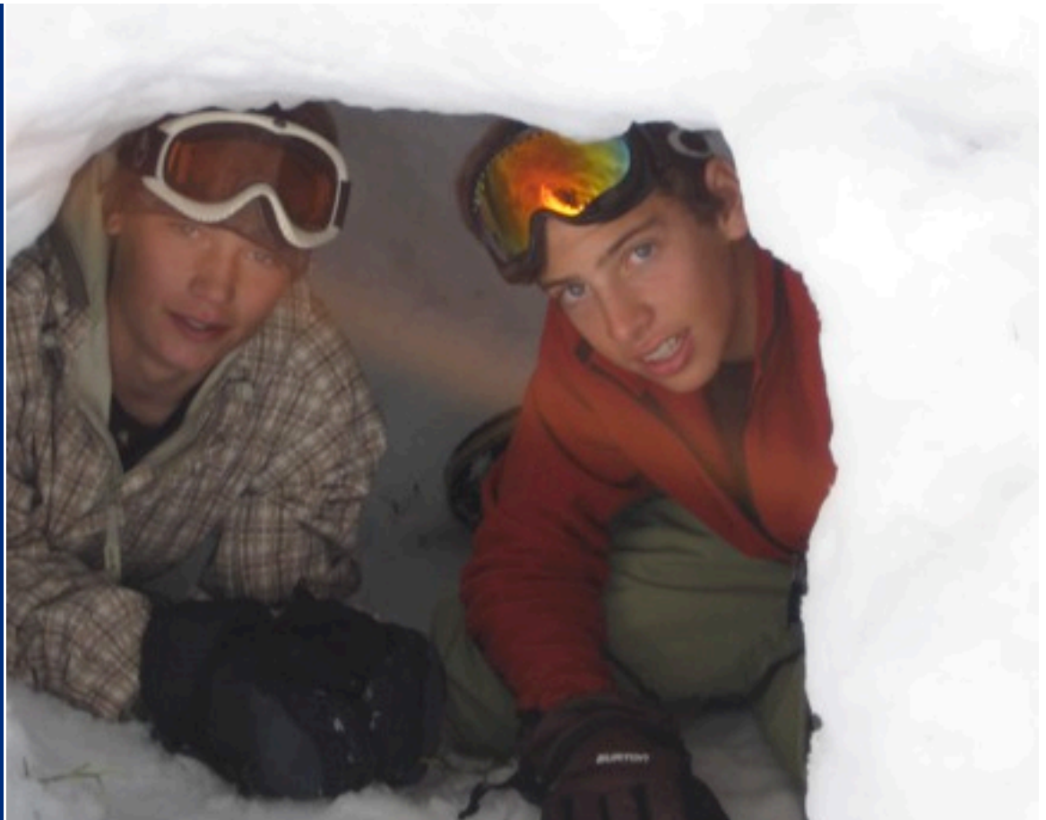
A shelter made of snow provides a well insulated place to get out of the cold and wind.