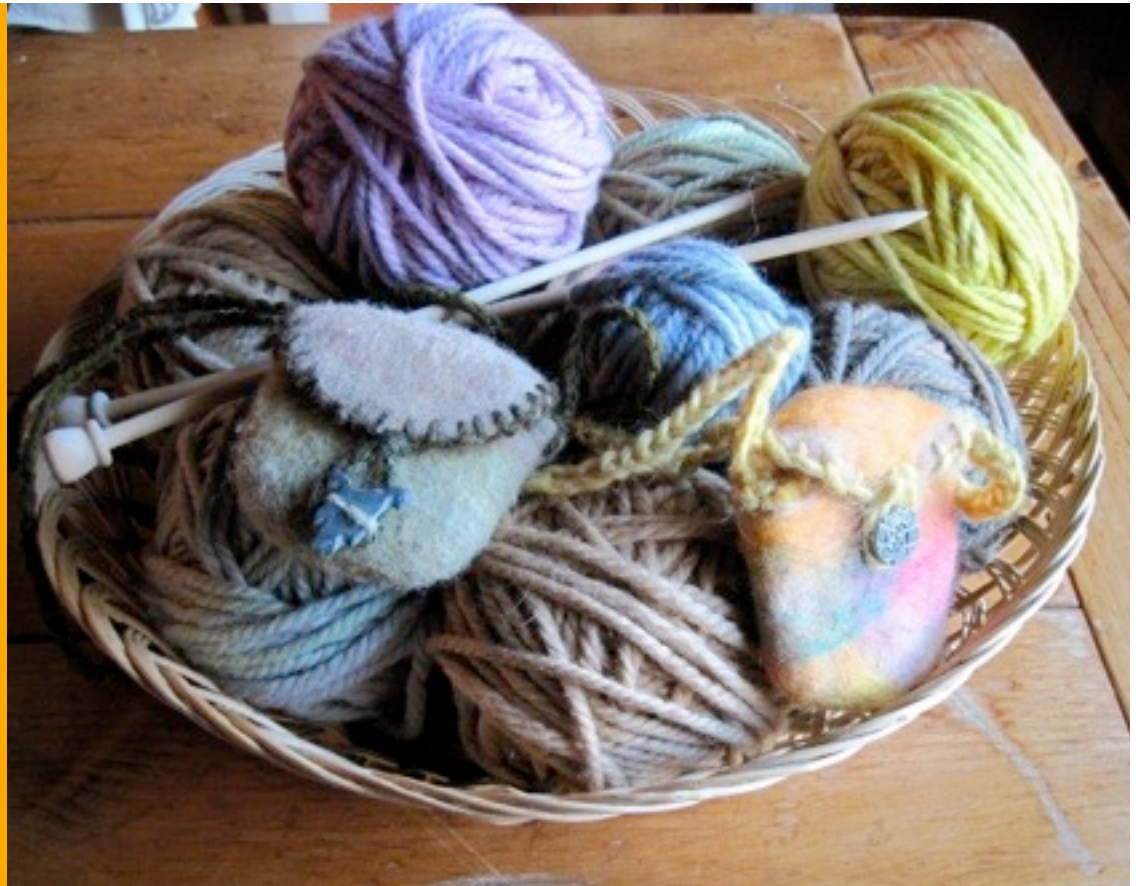
Plant dyed yarn with felted wool pouches